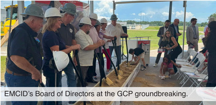
EMCID's Board of Directors at the GCP groundbreaking.

EMCID's Board of Directors and representatives from GCP Paper, Satterfield & Pontikes Construction Company, and Powers Brown Architecture celebrated on June 27 the official groundbreaking of GCP Paper USA's $400 million, 565,765-square-foot manufacturing facility in the East Montgomery County Industrial Park in New Caney.