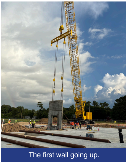
The first wall going up.

See the first week of wall erection time-lapse video: