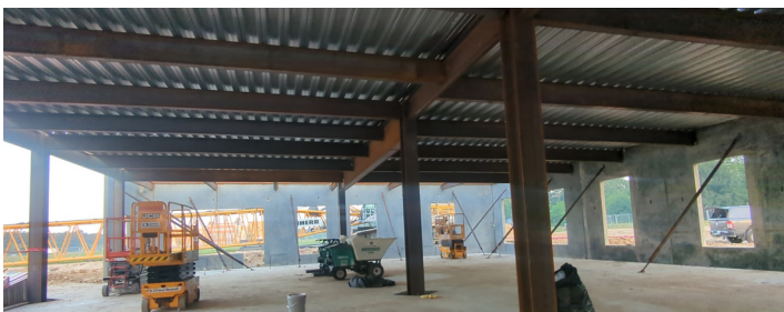
Inside the Admin/Kitchen showcasing the structural beams.