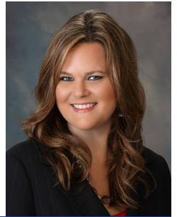
VP/Chief Communications Officer