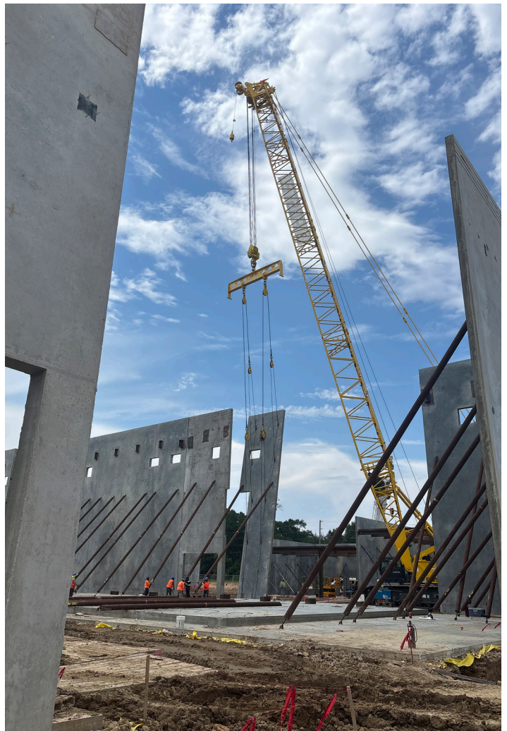
POSTEL crane raising one of the wall panels.