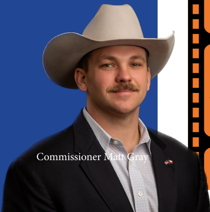
Commissioner Matt Gray