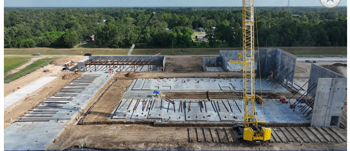
A wide look at the soon-to-be Exhibition Hall.

Head to our website and social media sites for more frequent updates!