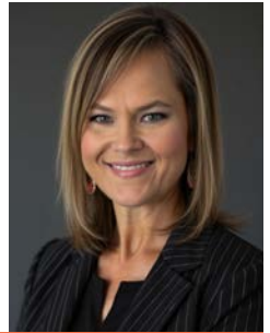
Chief Operating Officer