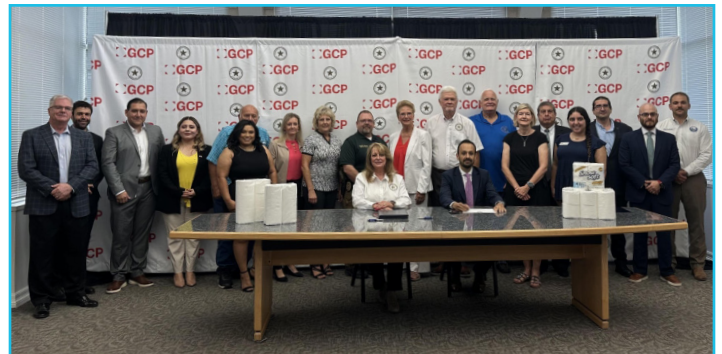
GCP Paper USA Inc. officials agreed to a $400 million investment in the East Montgomery County Industrial Park.