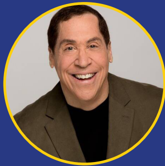
Special Guest Speaker Roy Firestone American sports commentator & journalist

Monday, February 24, 2025 | Begins at 6pm