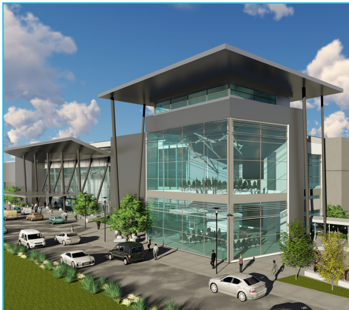
Rendered image of perceived, future convention center in Valley Ranch Town Center.

We anticipate continued retail and industrial development with an improving economy and a new presidential administration. We're currently negotiating with no fewer than eight manufacturers looking at making East Montgomery County their home and adding hundreds of local jobs for our residents.