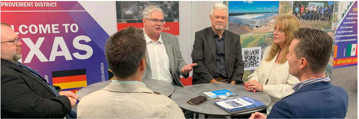
The EMCID Board of Directors had the opportunity to speak with a company from Sweden that is looking into expanding operations to the United States. The company develops technology to increase production flow in the food and beverage industry as well as the energy sector.