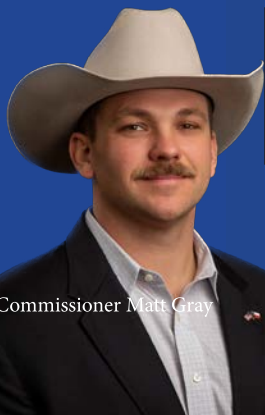
Commissioner Matt Gray

AV BULL SALLAS PARK 21675 McCLESKEY RD NEW CANEY, TX 77357