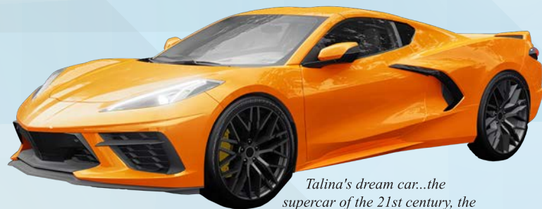
Talina's dream car...the supercar of the 21st century, the Chevrolet Corvette C8.