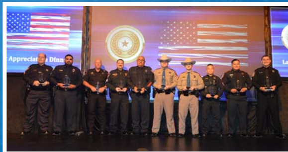
Officers of the Year recipients.