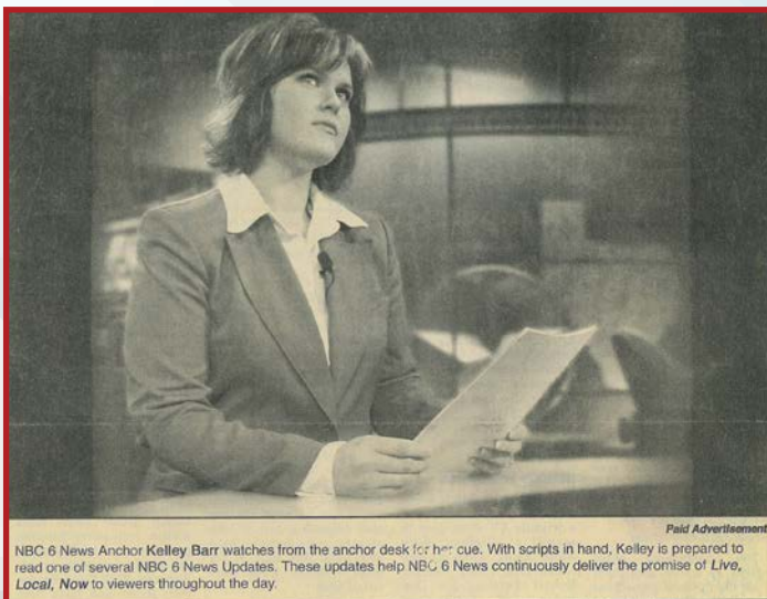
Left: an advertisement in the Killeen Daily Herald in 2007.