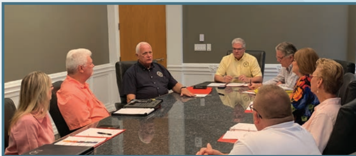
Board of Directors workshop, July 2022.