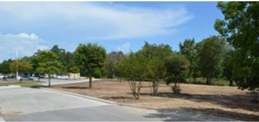
Above top, crews from Zachry-Odebrecht Parkway Builders survey EMCID's property before demolishing what now belongs to the Texas Department of Transportation. Above, 47 parking spaces have been replaced with dirt. Stakes remain across the property along the detention pond and toward the U.S. Highway 59 frontage road.

A six-person jury for Montgomery County Court-At-Law #2 awarded EMCID $4,032,142 for property taken in eminent domain proceedings by the Texas Department of Transportation (TxDOT) for the construction of the Grand Parkway. The judgment was handed down May 19. EMCID lost one-third of its parking lot, a storage facility, a site on the south end of the property designated for future construction, a water well, the front driveway, signage, and trees when TxDOT condemned a portion of the District's 12.85 acres in 2015 to use as right-of-way for the Grand Parkway at Interstate 69/U.S. Highway 59.