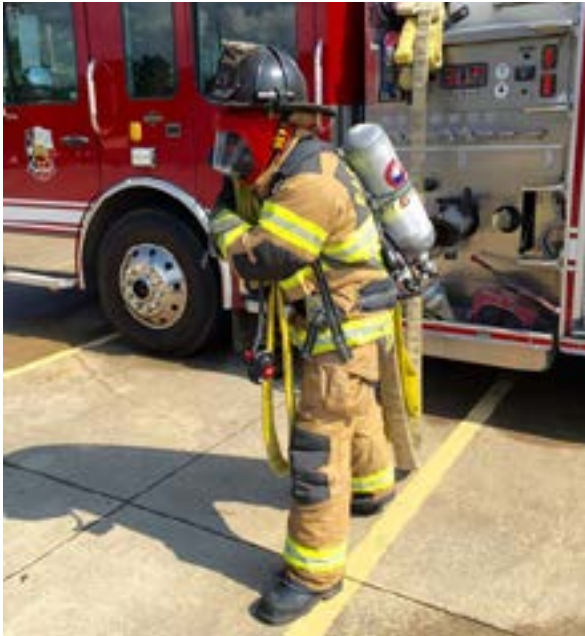
A firefighter with the EMCFD puts on his new Self Contained Breathing Apparatus (SCBA), purchased with EMCID grant funding, before heading out to a fire.

The grant agreement stipulates that the fire department utilize the first payment to upgrade to code Fire Station #156 on Morgan Cemetery Road in Splendora — which had not been providing 24-hour service or staffing — to make it ready to be staffed around the clock, at a cost of about $56,000. Approximately $125,000 of the first payment will be used to pay for replacement of half, or 15, of the fire department's aging self-contained breathing apparatus systems for firefighters, and the balance of the funds will be utilized to buy other necessary equipment like firefighter locator monitors, which can quickly be deployed in the event contact is lost with a firefighter during fire ground operations.