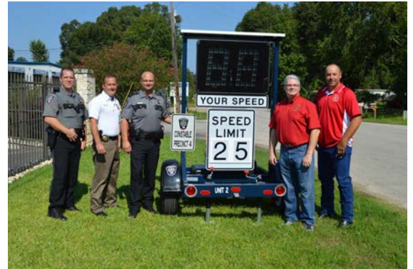
Grant funds awarded in the spring of 2016 purchased speed monitors and trailers for the Precinct 4 Constable's Office.