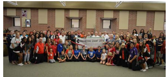
Grant funds awarded to the New Caney ISD Education Foundation in the fall of 2015 went to the foundation's Cornerstone Grant, which helped transform campus libraries into areas offering students the use of 3D printers, LEGOs, robotics, claymation and green screens for video production.