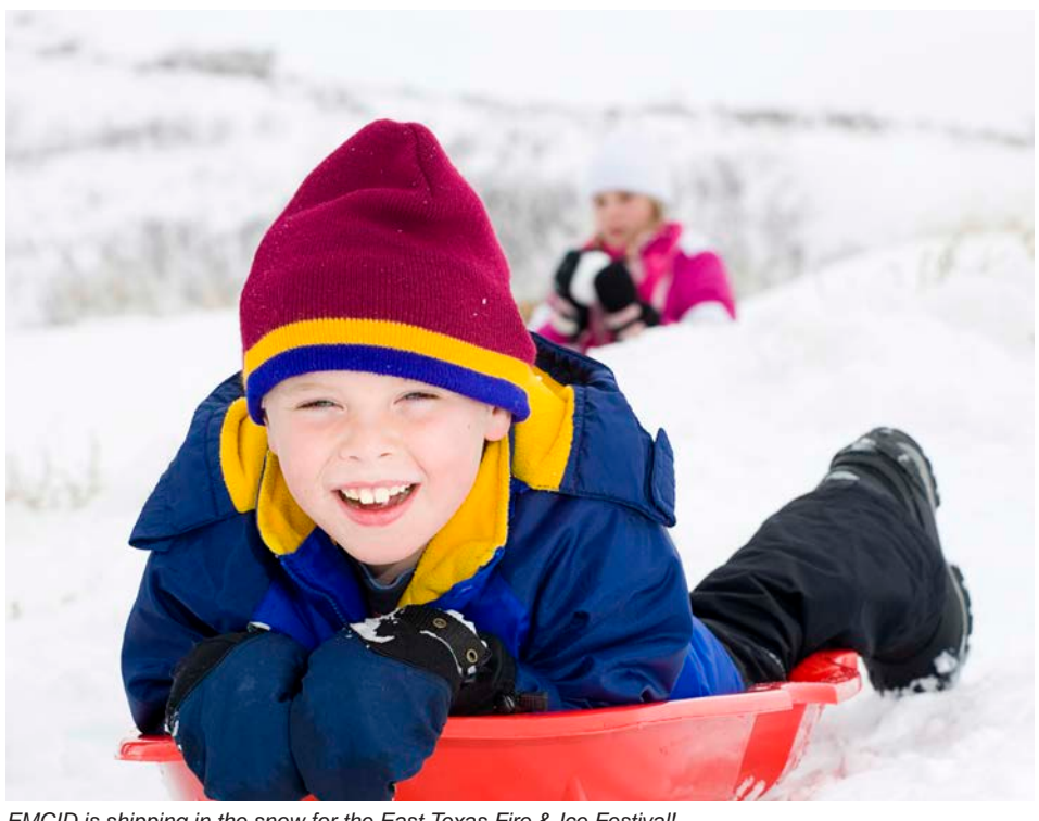
EMCID is shipping in the snow for the East Texas Fire & Ice Festival!

The Farmer's Almanac says the United States will have an unusually cold winter. Whether that's true or not, EMCID can guarantee there will be snow in January! The highly anticipated fourth festival, East Texas Fire & Ice Festival, will take place Saturday, January 9 at Texan Drive Stadium in Porter, Festivities will kick off at 11a.m. with a Color Run, benefiting the East Scholarship Montgomery County Foundation. Next, get ready for some finger-licking good food, a KidZone complete with a snow hill for sledding and a snowman-building competition and retail vendors. Beginning at 1 p.m., get your groove on with several bands performing, including GRAMMY