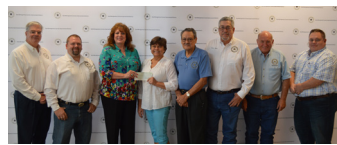
New Caney New Horizons, Inc., $28,712

Grant funds sponsored a minimum of 27 kids, ages 7-17 from East Montgomery County, for the 2015 Camp Watsitumi, a therapeutic camp held August 4-7 in Conroe.