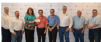
Montgomery Co. Youth Services, $6,000

Funds will pay for a freezer/cooler combination unit along with safety items so that the Mission Northeast can accept additional donations to continue to provide social services.