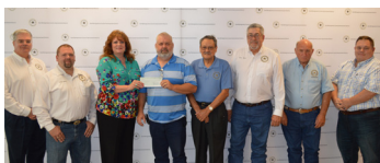
East Montgomery County Historical Society, $11,000

The Board of Directors presented checks at its June 24 and July 9 regular meetings to those organizations that were approved for Community Development Grants. Grants are funded twice a year to governmental entities, non-profit corporations and other organizations for projects that improve the quality of life for residents in East Montgomery County.