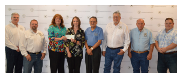
Splendora Junior High School AV Club, $8,000

Funds will replace the organization's van that was bought in 1999 with an EMCID Community Development Grant. The original van will continue to be used to transport goods and supplies.