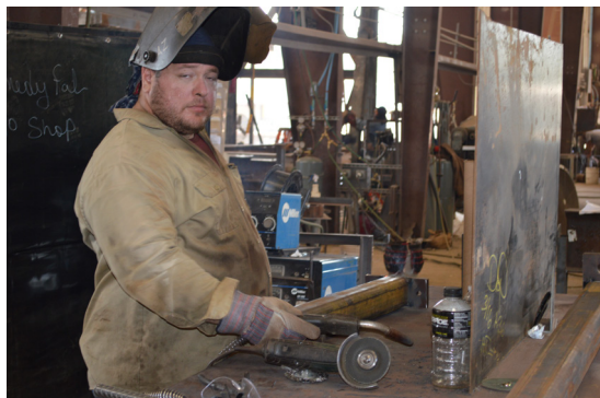
Financial incentives through EMCID's Economic Development Corporation helped Kennedy Fabrication/Kennedy Rig Services in Splendora expand. The companies provide jobs to more than 450 people.

EMCID also agreed to provide future financial incentives to various developers and businesses that want to construct, expand or relocate services within the District. These kinds of incentives helped expand the Valley Ranch Town Center development, attract BreWingZ, Pollo Tropical, Taco Cabana and McDonalds to the Village at Northpark center, grow the East Montgomery County Industrial Park and create jobs for our residents.