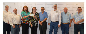
Splendora Junior High School Science Club, $4,000

Funds will be used to start an AV club for the Fall 2015 semester and to purchase audio/visual equipment.