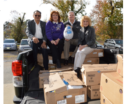
EMCID provided 50 turkeys and 20 hams last December to the Mission Northeast.

EMCID, through its non-profit subsidiary the East Montgomery County Scholarship Foundation (EMCSF), also made available $1,000 to every high school graduate and GED recipient. The scholarship program was expanded to include up to 20 - $500 merit-based scholarships for current college students who want to continue their post-secondary education.