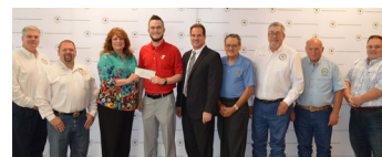
East Montgomery County YMCA of Greater Houston, $3,500

Funds will purchase 10 Axon Body cameras to be worn by each on duty officer.