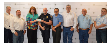
City of Roman Forest PD, $4,350

Funds will purchase new and replacement equipment for the city park.