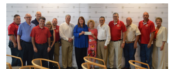
Mission Northeast, $49,010.50

Funds helped reduce the cost of an 11-week summer day camp in Splendora for at least 116 youth from East Montgomery County. The camp ran from June 8 - August 21.