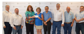
City of Roman Forest, $9,000

Funds will purchase new and replacement equipment for the city park.