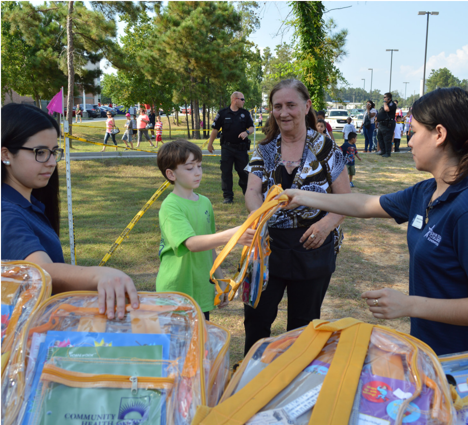
Volunteers from Lone Star College - Kingwood handed out free backpacks to hundreds of students at the Back to School Bash in 2014. Local businesses also provided school supplies.

Hundreds of area children and their parents are once again expected to take advantage of EMCID's annual Back to School Bash. The free event will be held Thursday, September 10 from 5 - 8 p.m. at the EMCID Complex.