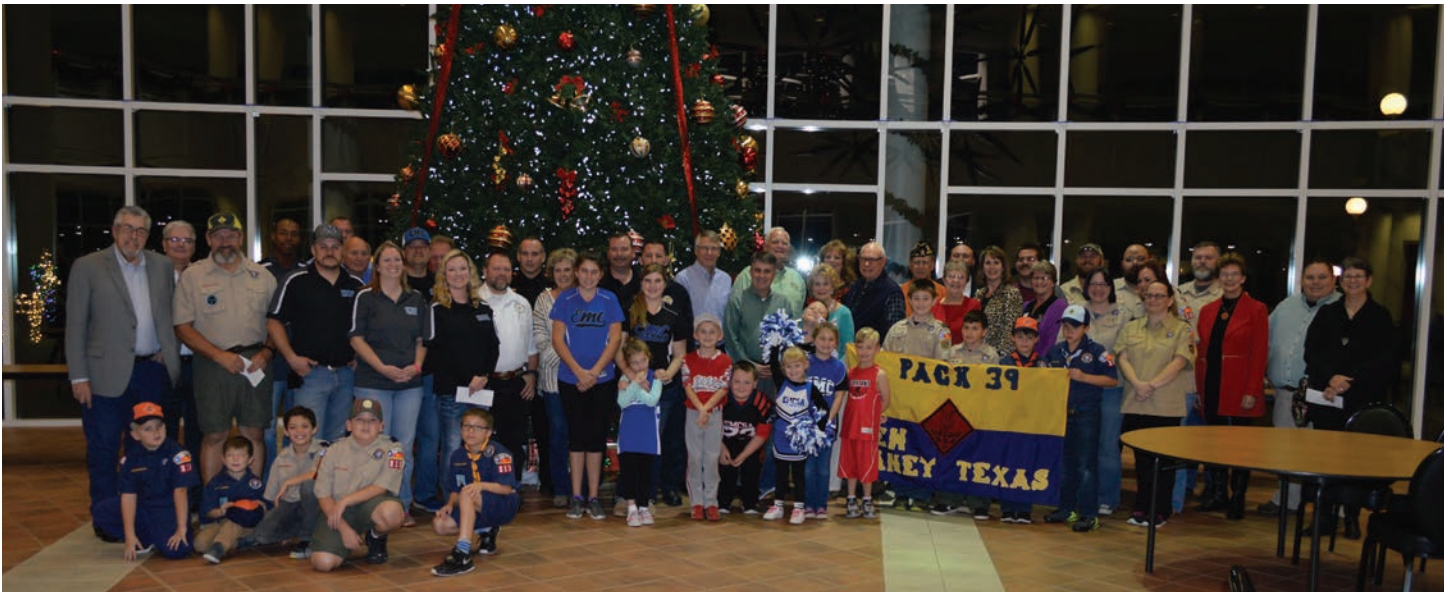
Grant recipients pose for a picture in the EMCID Complex Atrium December 14, 2017.

Grant applications may be found online at www.emctx.com/services/community-development or picked up in the office. Submissions for the Spring grant cycle are due by March 26 at 5 p.m.